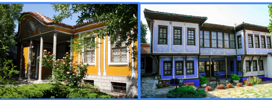
The historical houses

Nowadays the old town charms with its multifarious and preserved sightseeings, which are scattered in comparatively small area. The visit of the old town can be compared with one walk in time.