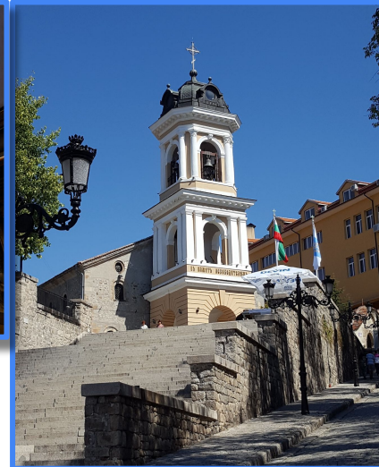
The church of the Holy Mother of God