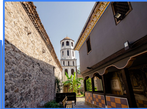
The church “St Constantine and Helena”