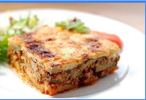
m u s a k a